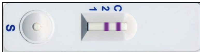
Positive for Genogroup II